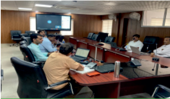
Webinar by PAT Cell

UPSDA organized a series of webinars for designated consumers of Uttar Pradesh. In the continuity of this, 1st webinar was organized on 25th August 2022 for Thermal Power Plant. The objectives of this workshop were to create awareness among the designated consumers about the PAT Schemes, various timelines, Normalization, Issuance of ES Certs, Enforcement of the PAT Scheme, and Showcase the best practices taken by them.