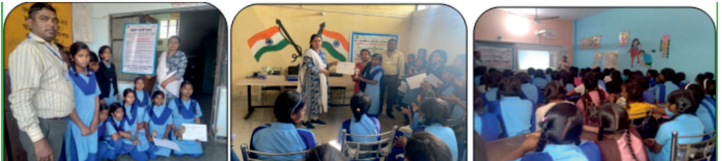
Student Capacity Building Programme in different Schools

Student capacity building programs are organized in all the 746 Kasturba Gandhi Balika Vidyalaya