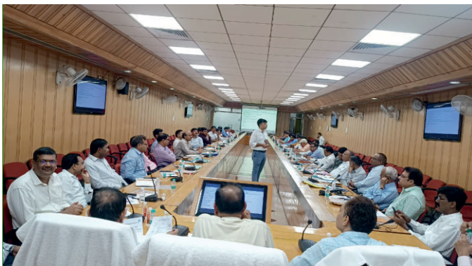
ECBC Training Programme

EEB Cell is established by BEE at UPSDA. Role of EEB Cell is Monitoring of implementation of UPECBC-2018, Technical support in the implementation of UPECBC to govt. stakeholder departments through demonstration building projects, organize training to govt. and private stakeholders regarding ECBC code and Eco Niwas Sanhita for