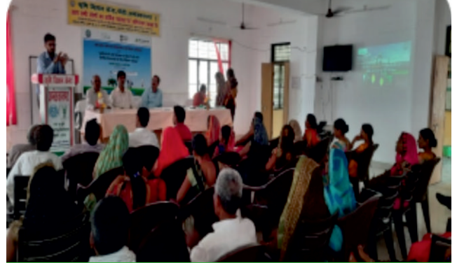
Workshop at "Krishi Vigyan Kendra, Ambedkar Nagar

In Agriculture sector UPSDA have organized many programs on energy efficiency. During 1st Quarter of 2022-23 UPSDA conducted 40 agricultural workshops for farmers in various Krishi Vigyan Kendra and during 2nd quarter total 46 programs are organized covering all the 86 Krishi Vigyan Kendra of Uttar Pradesh. During this workshop, the instructor provided valuable insights into the utilization of 5-star rated irrigation pumps and energy-efficient electrical appliances, including LED bulbs and BLDC fans. The workshop also covered the efficient utilization of diesel pumps, tractors, and motor pumps to conserve energy.